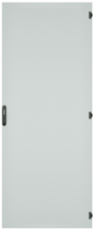
Sheet steel door, single wing, closed