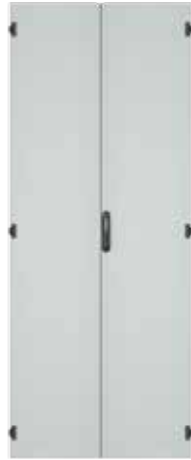
Sheet steel door, double wing, closed