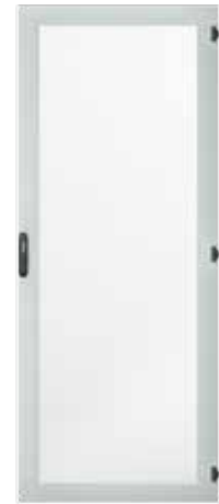
Sheet steel door, single wing, passive ventilation (honeycomb perforation, 81% open area)