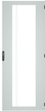
Glazed door, single wing, with 3 mm SPSPG