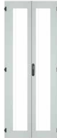
Glazed door, double wing, with 3 mm SPSPG