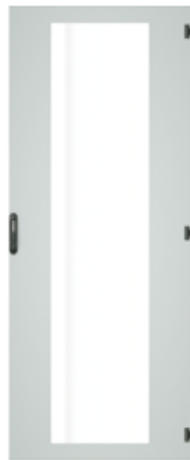
Glazed door, single wing, with 3 mm SPSSG