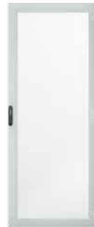
Sheet steel door, single wing, passive ventilation (honeycomb perforation, 81% open area)